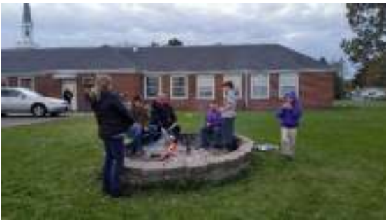
March 29 in Peoria.